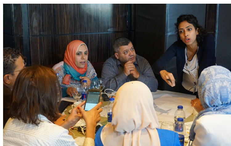
Women actively engaging in planning process.