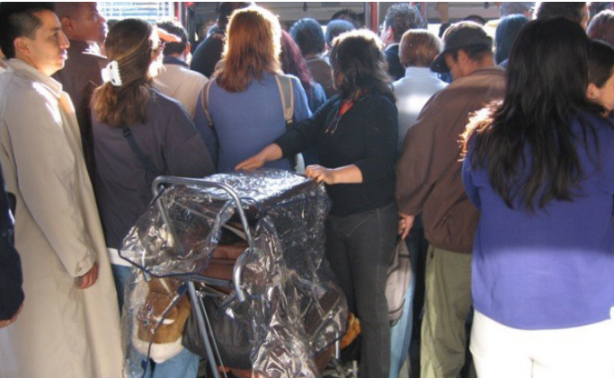
Women with stroller trying to enter bus.

They use public transport and walk more than men and tend to make more off-peak and non-work related trips, traveling to more disperse locations. They are also more likely to trip chain, meaning that when they travel, they tend to have multiple purposes and multiple destinations within one trip. This can be taken into account in the fare structure and the layout of new transportation routes.