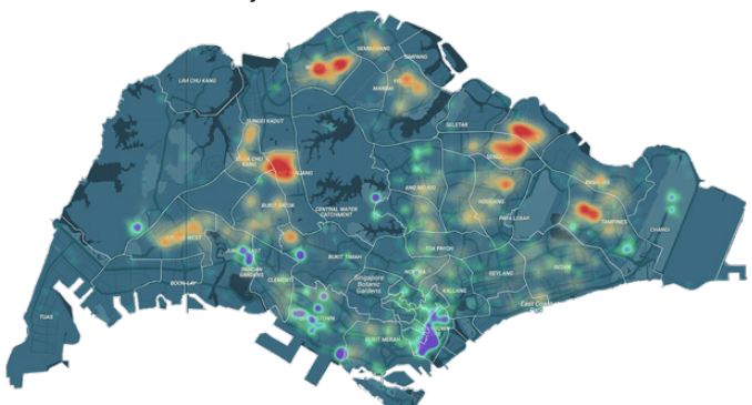
Heatmap of crowdsourced routes, Author: Beeline

Beeline: In 2015 Singapore's Government Technology Agency (GovTech) and the Land Transport Authority (LTA) came together and created the transport app Beeline. The application supplies a demand driven approach where users can pre-book bus routes and track the buses to provide door-to-door mobility. Although it is not a complete MaaS system (currently officially considered a vision), there are certain things to take into account when trying to build one. The bus network is crowdsourced with the chance for users to suggest further routes. The collaboration between the governmental institutions and academia has led to anonymous and aggregated public transport data as well as user demands being the basis for a clear map of demand. In this way new bus operators are encouraged to settle and provide new bus routes that has not yet been covered.