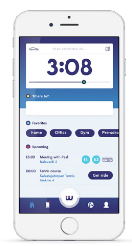
Interface of the Whim App

The company made its breakthrough when the local transport authority provided its open data as interface