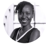
Naomi Mwaura Flone Initiative