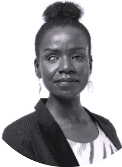
Crystal Asige Kenyan Senate

Hear from Senator Crystal Asige, Disability Rights Activist from Nairobi, Kenya