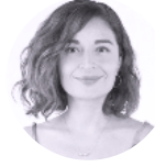
Laura Ballesteros Mexican Senate, Mujeres en Movimiento