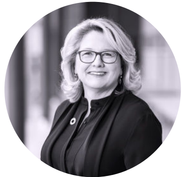
Svenja Schulze Federal Minister for Economic Cooperation and Development