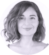
Laura Ballesteros Mexican Senate, Mujeres en Movimiento