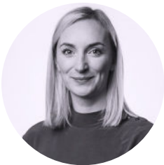
Insa Illgen GIZ / TUMI