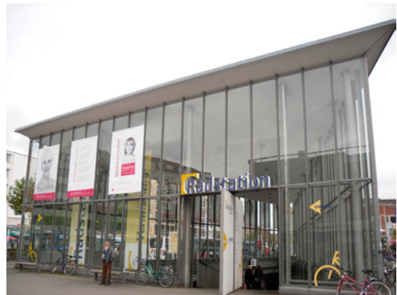
Figure 28 Bicycle station in Muenster.

After the bicycle station was opened, the attractiveness of cycling increased remarkably. About 2,000 people switched from other transport modes to cycling.