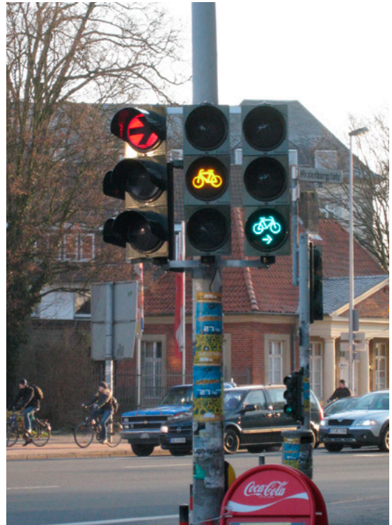
Figure 18 Traffic lights for cyclists – type 1.

The second and the third types are usually combined with traffic lights for motorised traffic. If the common traffic light is placed on the right-hand-side of the cycle way, cyclists have to comply with the common traffic light. This second type is shown in Figure 19.