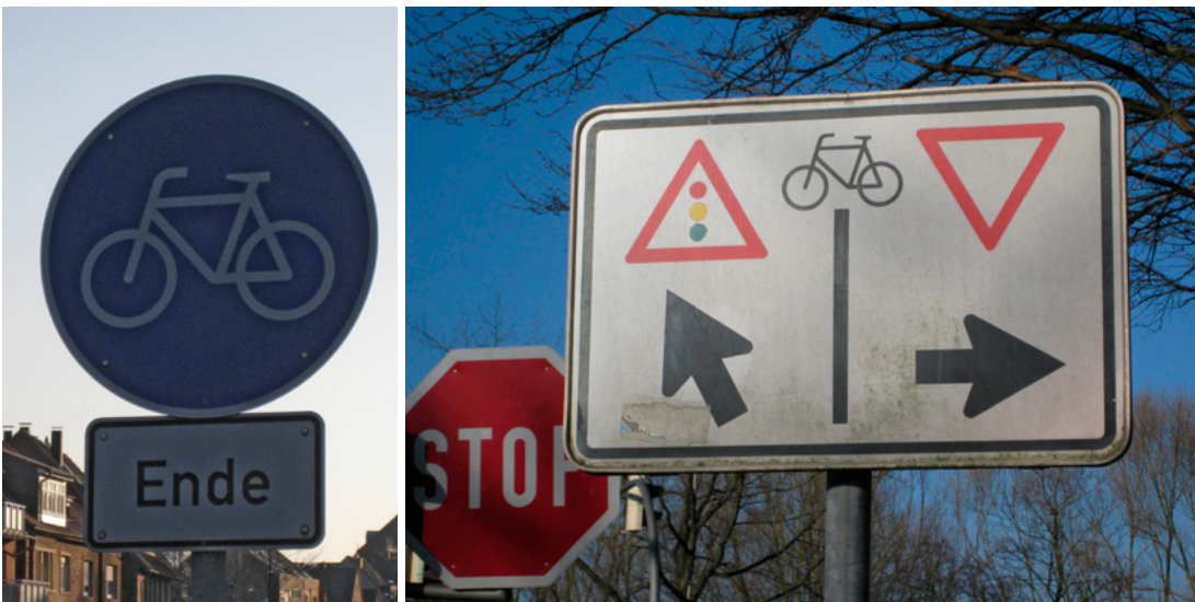
Figures 21 Signs “End of cycle path” (left) and announcement of bicycle traffic regulation at the next intersection (right).

In addition to the regulation by traffic lights, there are special traffic signs. As it was already mentioned in the earlier sections, every facility or preference given to the cyclists, e.g. at dead ends, pseudo one-way streets or pedestrian areas, need to be clearly indicated by signs. Furthermore, there are signs for “Dead angles”, special regulations at bus lanes or indicating bi-directional cycle ways, etc. But, there are several other signs indicating in which way cyclists will be led before reaching a particular location, e.g. when a cycle path ends (Figure 21 left) or the access at an intersection requires special attention (Figure 21 right) such signs are installed.