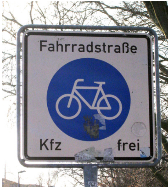
Figure 14 Sign "Bicycle Street".

Bicycle streets are streets in residential areas where bicycles are the dominant mode of transport. Here all motorised vehicles have to give way to bicycles. Furthermore, cyclists are allowed to cycle besides each other without getting sanctioned. In Muenster, 16 of these particular streets exist. It is planned to extend this number up to 27. Figure 14 shows a typical sign that indicates a bicycle street.