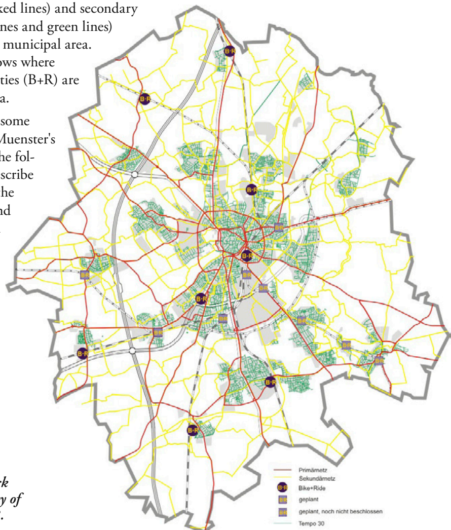
Figure 2 The bicycle network of the municipality of Muenster in 2008.

After introducing some basic facts about Muenster's bicycle network, the following sections describe basic elements of the bicycle network and give more detailed information on certain components of the infrastructure.