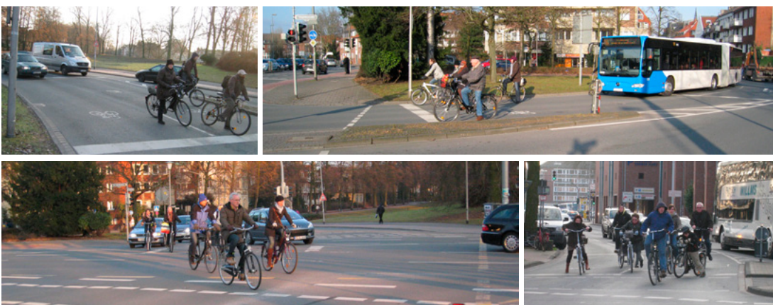
Figures 9 Flood gates.

The indirect turn-left is very safe, but also somewhat circuitous. On side streets which turn into a main street at intersections controlled by traffic lights, a convenient solution for cyclists turning left was developed: the bicycle floodgate (cf. Figure 9). Therefore an additional stop line approximately 10 meters in front of the actual stop line at the traffic light was marked on the street. While the first line is for the cyclists, the second one is for cars. This creates a space in which 20 to 30 bicyclists can gather during a red light phase. When the light turns green for this direction, the cyclists can cross the intersection in all directions, straight or to the left. The cars follow behind. In this way, the car driver can always observe the bicycle traffic in front of his car and hence this ensures a safe solution for cyclists.