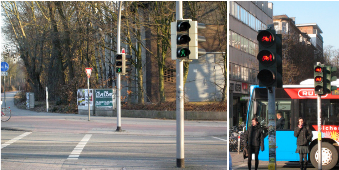
Figures 20 Traffic lights for bicyclists – type 3.

In addition to the regulation by traffic lights, there are special traffic signs. As it was already mentioned in the earlier sections, every facility or preference given to the cyclists, e.g. at dead ends, pseudo one-way streets or pedestrian areas, need to be clearly indicated by signs. Furthermore, there are signs for “Dead angles”, special regulations at bus lanes or indicating bi-directional cycle ways, etc. But, there are several other signs indicating in which way cyclists will be led before reaching a particular location, e.g. when a cycle path ends (Figure 21 left) or the access at an intersection requires special attention (Figure 21 right) such signs are installed.