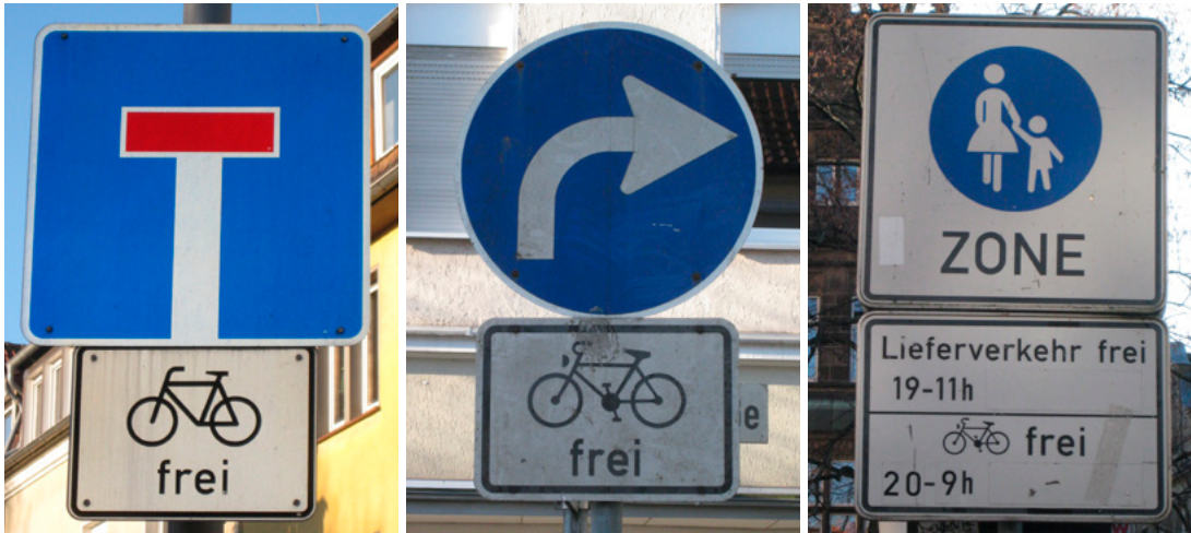
Figures 16 Free thoroughfare at a dead end (left), revocation of turn-left prohibition (centre) and pedestrian area where cycling is only permitted between 20:00 and 9:00 (right).

There exist other regulations that support the flexibility of cycling in Muenster. These include e.g. free thoroughfare for cyclists at dead ends and also intersections where turning into certain directions is forbidden for cars.