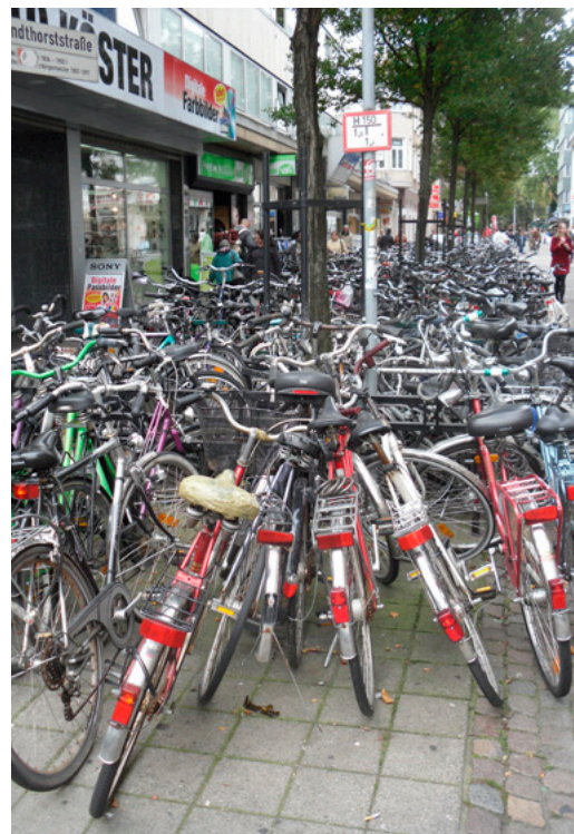
Figure 25 Bicycle parking within the Old Town.

Another challenge of parking management is the central cantina at Muenster’s university. The bicycle is the most widespread transport mode amongst 55,000 students. During lunch time, when the cantina is frequented by an extremely high number of students, parking bicycles often becomes very difficult.