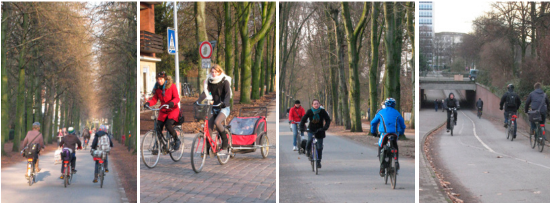
Figures 7 Impressions of Muenster's Promenade.

5 meters and the fact that cyclists can drive through with hardly any interruptions, the Promenade is also called the highway for bicycles.