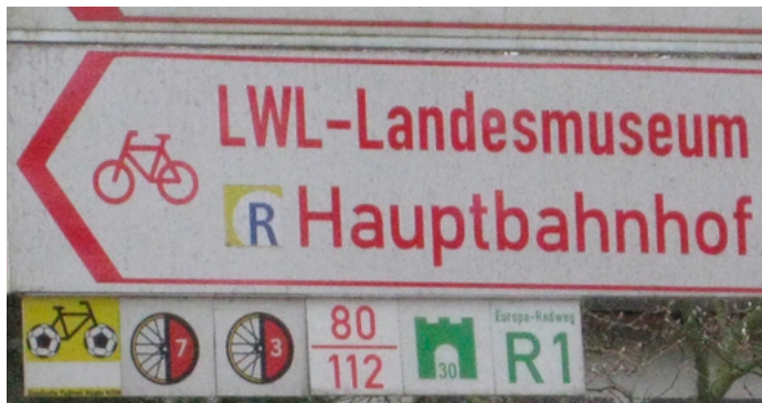
Figure 23 Further signs indicating particular routes.

As it is displayed in Figure 23, number 80 and 112 stand for such a particular route. For instance this can be a route that leads along cycle ways situated away from major traffic axes where relaxed cycling is possible. Likewise signs can indicate that the cycle way is part of a historical route (marked by the castle door) and also part of the European cycle way number R1.