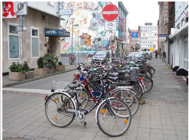
Figures 15 Pseudo one-way streets.