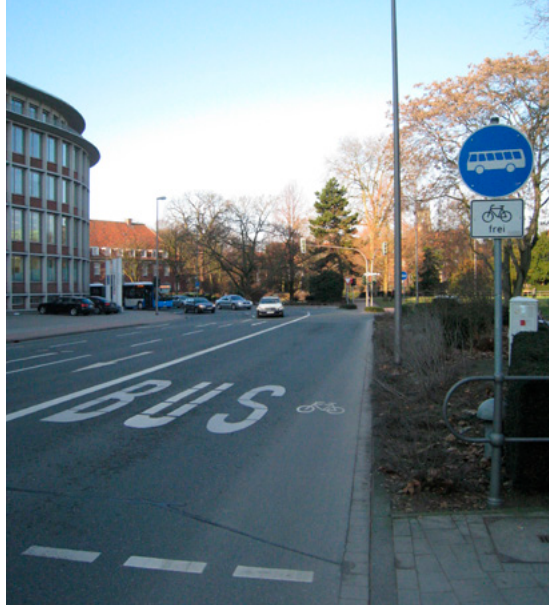
Figure 5 Cyclists and buses operate on the same lane.