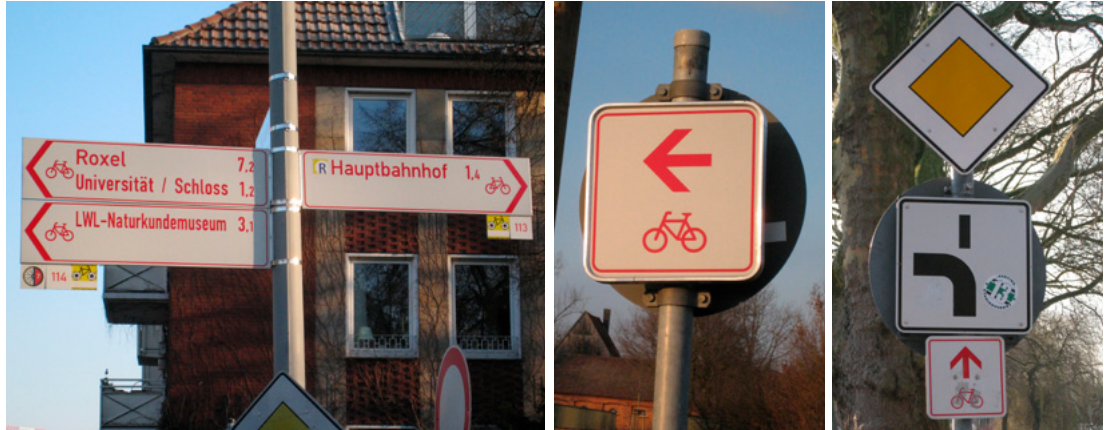
Figures 22 Signposting within Muenster's bicycle network – main signs (left) and intermediate signs (middle and right).

In addition to the above type of signs, there are also signs indicating specific routes. Several circular routes that are marked with a specific number are currently part of the bicycle network.