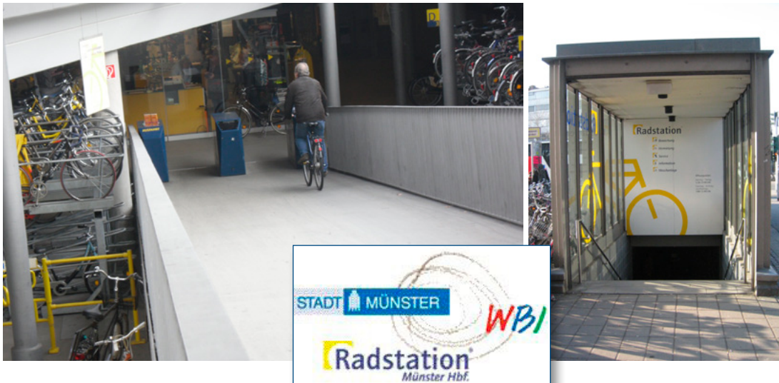
Figures 30 Bicycle station – Ramp and steps.

The bicycle station was planned by the city of Muenster who commissioned the WBI (Westfälische Bauindustrie GmbH) for construction and operation of the station. Today the station is monitored and serviced by a tenant who was instructed by WIB.