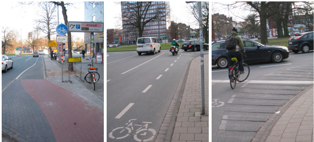
Figures 11 Leading into the roundabout (left and centre) and rumble stripes at slips of roundabout (right).

Along the drives into the roundabout, cyclists are led from red paved lanes on sidewalk level down to segregated lanes on street level (Figure 11 left). Hence vehicle drivers become aware of cyclists before entering the roundabout. The function of lined bars has already been explained in 3.1.2. At Ludgeriplatz these are used to guide cyclists into the roundabout safely (Figure 11 right).