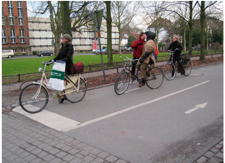
Figures 6 Bi-directional cycle ways in Muenster.