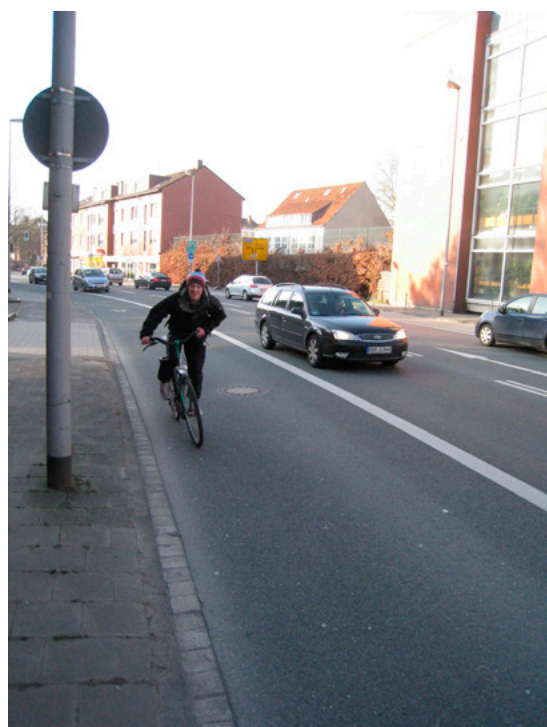
Figure 4 On-street cycle lanes with permanent bar.

The second type consists of cycle lanes on street level. They are located at a height equal to the road body and usually placed between the traffic lanes and the sidewalks. White bars provide a visual separation of these from the motorised traffic. Here also, two different types of bars exist which motorised traffic users have to look out for. In the first case (Figure 4), a permanent white bar indicates that the bicycle lane is only for cyclists. In this case, motorised traffic is not allowed to enter the lane. On the contrary, if the bar is lined (safe guard), cars are permitted to cross the bar only, when they do not disturb or jeopardise cyclists. The latter type of bar is usually applied in narrow streets where assigning dedicated spaces to cycles is not a feasible option.