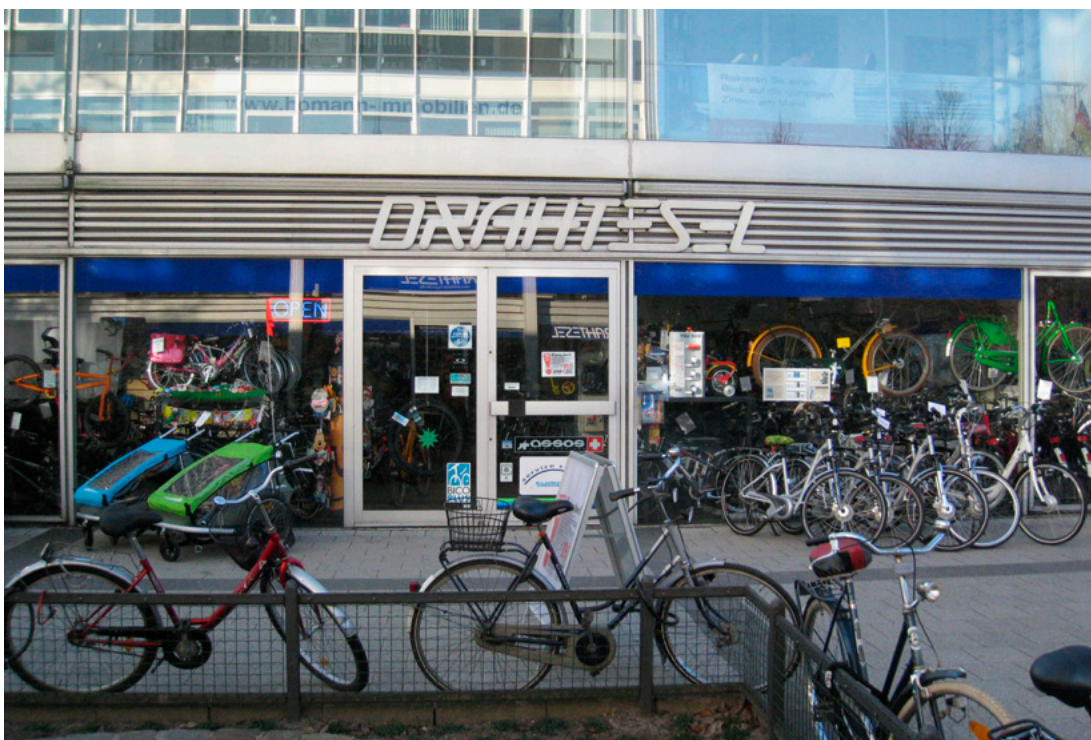
Figure 31 One of Muenster's 40 bicycle stores.

In Muenster there are about 40 bicycle stores. That means that one bicycle store serves 7,000 residents. Hence Muenster is not only Germany's leading city for cyclists, but also the leading city of commerce and services associated with bicycles. Muenster provides even a mobile repair service, the "Leezendoc", which reaches its customers by a car packed with spare parts to get the bikes back on the road as quickly as possible.