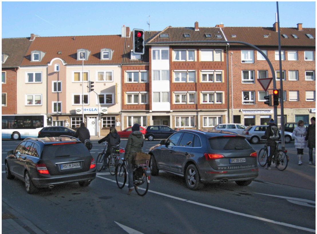
Figure 19 Common Traffic lights for cyclists and motorised traffic – type 2.

Furthermore the third type is given, where cycle ways and sidewalks are at the same level. At intersections both ways are adjacent to each other and curbs are lowered equally (cf. Figure 20 left). Then there are traffic lights that indicate a pedestrian count for cyclists as well. As a variation of the type three lights, there also exist traffic lights that directly indicate their compliance for both, cyclists and pedestrians. This type is displayed in Figure 20 (right).