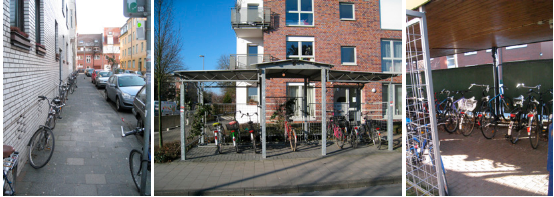
Figures 27 Bicycle parking in residential areas.

The construction of parking facilities in residential areas became problematic since residents claimed that parked bicycles would hamper walking along sidewalks. Therefore, the State-Government regulated by law that new buildings must provide a certain number of parking facilities for bicycles. In apartment houses, for example, bicycle sheds or cages present themselves as a good solution, while individual solutions can be found for single occupancy houses. Often the bicycles are simply placed in the garage and the car is left outside.