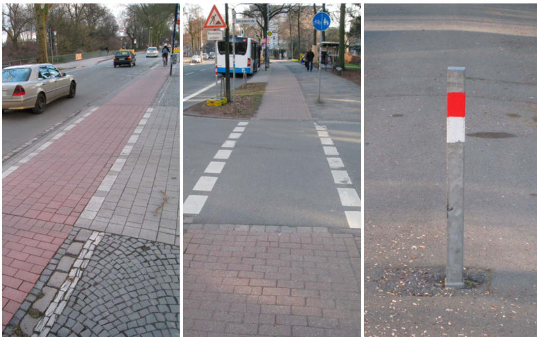
Figures 17 Lined marking at a property entrance (left) and a street crossing (centre), marked pile (right).

Cycle ways are often crossed by ways of other traffic participants. To ensure the visibility of cyclists for car drivers, lined marking can be added to increase safety of cyclists. Figure 17 (left) shows such a marking at a property entrance and Figure 17 (centre) at a street crossing. Moreover, piles preventing cars from entering cycle ways are marked with a white and a red stripe. This helps avoiding collisions of cyclist with the piles (Figure 17 right).