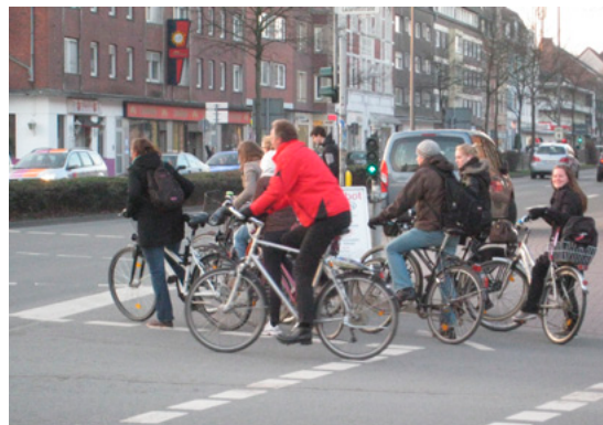
Figure 8 Indirect turn-left (waiting area).

Cyclists turning left have to cross motorised traffic lanes. Therefore this aspect requires special attention. At major intersections they are usually guided indirectly. That means that the cyclists first cross the crossing street parallel to the straight-going motorised traffic until they reach a waiting area (Figure 8) in the street. Afterwards they cross the main street before the traffic on the cross-street enters the intersection.