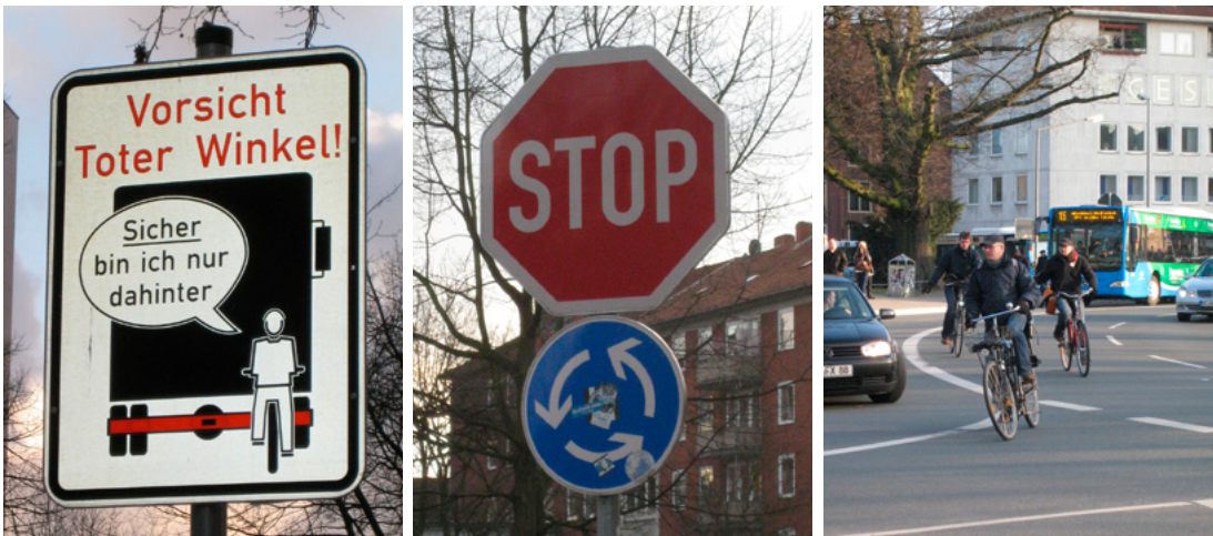
Figures 12 Sign: “Attention, dead angle” (left), sign “Stop” (centre) and Ludgeriplatz (right).

Directly at the drives into the roundabout, there need to be additional spaces for operation of larger vehicles such as articulated buses. Especially on the right-hand side of the right traffic lane such an area is required otherwise buses would run over the curbs. The problem with this additional space though is that cyclists can pass busses on their right side; and typically when buses enter roundabouts, their drivers are focused on the traffic within the roundabout while they do not observe what is happening at their right-hand side. And quite often cyclists stand in the area of the “dead angle”. Therefore the situation becomes very dangerous. Such traffic situations occurred repeatedly at Ludgeriplatz and this led to accidents where cyclists often got severely injured and some were even killed. Figure 10 (right) illustrates the solution for this problem. By implementing rumble strips in these areas, cycling becomes very uncomfortable, hence discouraging cyclists to overtake from the right. Additionally at the drives into the roundabout specific signs were placed to consciously prevent cyclists from entering the dangerous area. This sign reads as “Attention, Dead Angle – I am only safe behind the vehicle” (Figure 12).