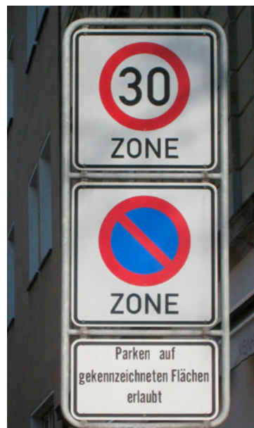
Figure 13 Sign – Entry of “30 Zone”.

In residential areas cycling is permitted on the streets. There segregated cycle paths do not exist since the width of roads is usually too narrow to provide sufficient space for all activities-driving, car parking, sidewalks and cycle ways. To calm down traffic within those areas, the maximum speed is restricted to 30 km/h. That is why they are usually called “30 zones” (Figure 13).