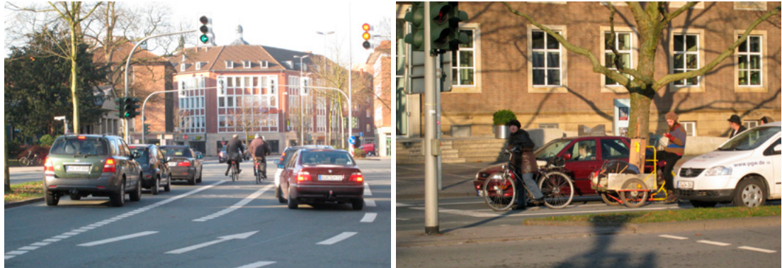
Figures 10 Segregated turn-left lane.

At some intersections the level of safety has been increased by special management of traffic lights, where cars and cyclists have their own separate signals. The light for cyclists turns green earlier than the lights for cars. Hence cyclists are able to pass the intersection safely and without any disturbance of motorised traffic, regardless of whether they turn left or go straight.